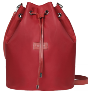
BUCKET BAG M REF. 73917