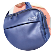
Twill nylon & leatherette Nylon sergé & simili cuir