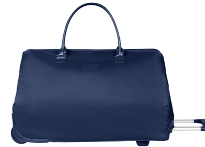
WEEKEND BAG/WH. FL CABIN - 2 WHEELS CABINE - 2 ROUES REF. 73905