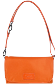
CLUTCH BAG S REF. 73912