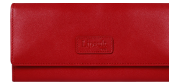
WALLET REF. 78606