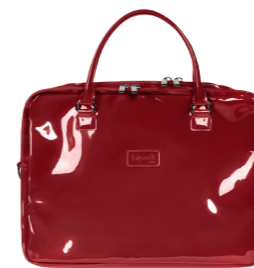
LAPT. BAILHANDLE 15.6" FL REF. 73896 ● ● ● 40 X 29 X 10 CM 0.78 KG 10 L