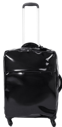
SPINNER 65/24 FL 4 WHEELS 4 ROUES REF. 66376 ● ● ● 44 X 65 X 28 CM 3.1 KG 71.5 L