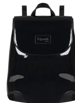
BACKPACK M REF. 77818