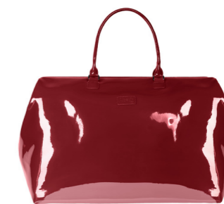
WEEKEND BAG M CABIN CABINE REF. 73900 ● ● ● NEW: ● 47 X 26 X 24 CM 1.18 KG 33.5 L