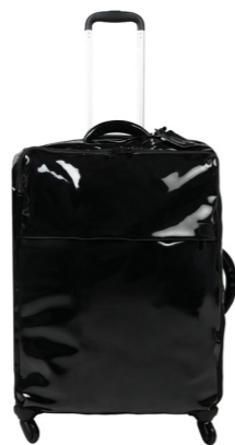
SPINNER 72/26 FL 4 WHEELS 4 ROUES REF. 66377 ● ● ● 50 X 72 X 28 CM 3.5 KG 96.5 L