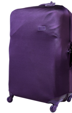
LUGGAGE COVER L REF. 3509 68398