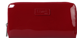
ZIP AROUND WALLET REF. 77821