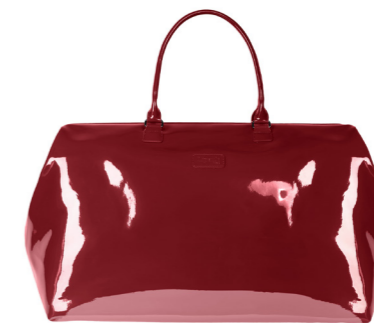
WEEKEND BAG L REF. 73899 ● ● ● 52 X 40 X 29 CM 1.35 KG 50.5 L