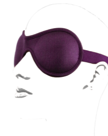
EYE MASK REF. 3509 64788 ● ●