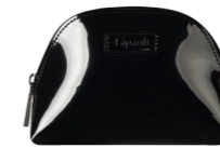
COSMETIC POUCH M REF. 77819