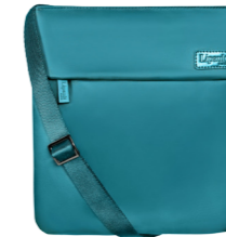
CROSSOVER BAG S REF. 74607