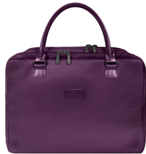
LAPT. BAILHANDLE 15.6" FL REF. 73911

● ● ● ● ● ● 40 X 29 X 4 CM 0.35 KG 4.5 L