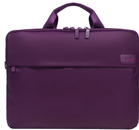
LAPTOP BAG 15.6"-17.3" FL REF. 73948

● ● ● ● ● ● ● ● 40 X 27 X 7 CM 0.4 KG 10 L