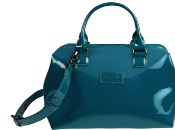
BOWLING BAG S REF. 68463