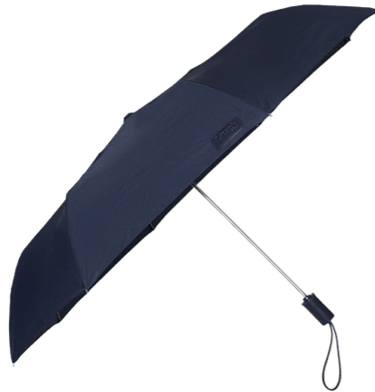
UMBRELLA 3 SECT. AUTO O/C REF. 3509 64795