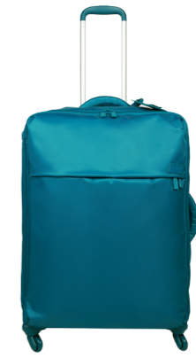
SPINNER 72/26 FL 4 WHEELS 4 ROUES REF. 64775 (JPF 4R 027 FL)