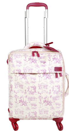
SPINNER 55/20 FL CABIN - 4 WHEELS CABINE - 4 ROUES REF. 64773 38 X 55 X 24 CM 2,3 KG 41,5 L