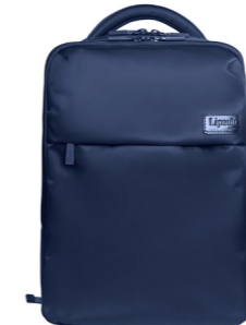
LAPTOP BACKPACK M 15" FL REF. 73952

● ● ● ● ● ● ● ● 28 X 43 X 15 CM 0.8 KG 16 L