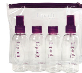
BOTTLE SET REF. 3509 64789 ● ●