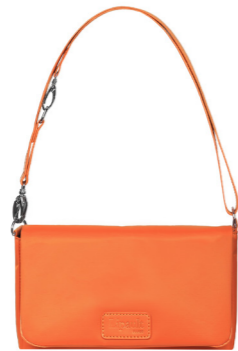
CLUTCH BAG M REF. 73913