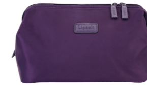
TOILET KIT REF. 62715

● ● ● ● ● ● ● ● ● NEW: ● ● 30 X 22 X 13 CM