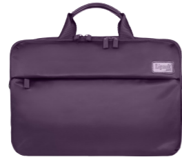
LAPTOP BAG 15"-15.6" FL REF. 73947

● ● ● ● ● ● ● ● 40 X 27 X 7 CM 0.4 KG 10 L