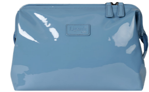
TOILET KIT REF. 77807