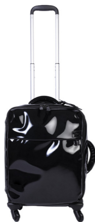
SPINNER 55/20 FL CABIN - 4 WHEELS CABINE - 4 ROUES REF. 64769 ● ● ● NEW: ● 38 X 55 X 24 CM 2.5 KG 41.5 L