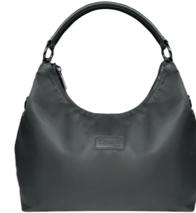
HOBO BAG S REF. 68460

● ● ● ● ● ● ● ● 28 X 28 X 11 CM 0.35 KG 10 L