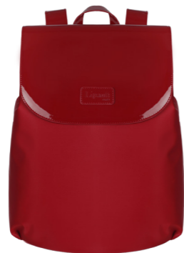
BACKPACK M BIMAT REF. 77816