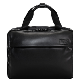
LAPTOP BAG 15.4" REF. 64272 (JPH 1008)