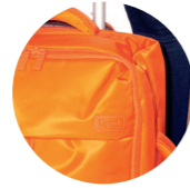
Twill nylon Nylon sergé