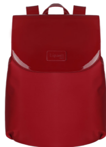
BACKPACK S BIMAT REF. 77814