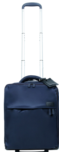
UPRIGHT 50/18 CABIN FOR LOW-COST AIRLINES - 2 WHEELS CABINE COMPAGNIES LOW-COST - 2 ROUES REF. 66172