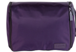
HANGING TOILET KIT 30/12 REF. 62612