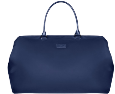
WEEKEND BAG L REF. 73904