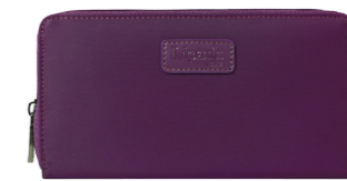
ZIP AROUND WALLET REF. 77806