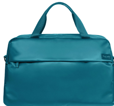
DUFFLE BAG REF. 74609