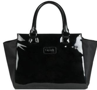
SACHEL BAG S REF. 73897