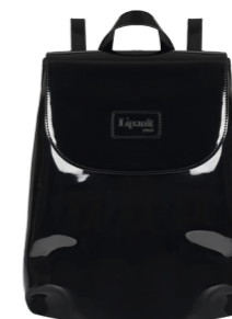
BACKPACK S REF. 77817