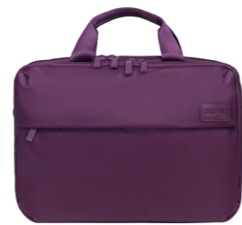
LAPTOP BAG 15.4" FL (3 COMPARTMENTS) REF. 73949

● ● ● ● ● ● ● ● 43 X 33 X 6 CM 0.5 KG 15 L