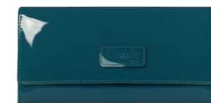
WALLET REF. 77820