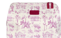
TOILET KIT REF. 62715 30 X 22 X 13 CM