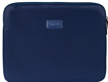
PC SLEEVE 15'' REF. 78080

● ● ● ● ● ● ● ● 26 X 21 X 2 CM 0.13 KG 1 L