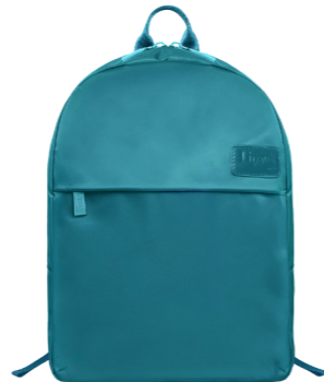
BACKPACK M REF. 74606