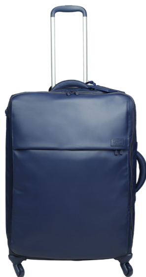
SPINNER 72/26 FL 4 WHEELS 4 ROUES REF.64785 (JPH 4R 027 FL)