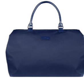
WEEKEND BAG M FL CABIN CABINE REF. 73902