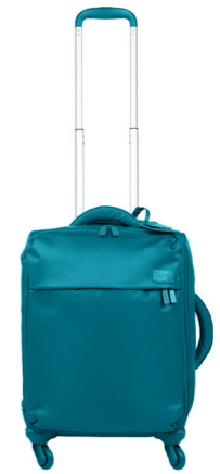
SPINNER 55/20 FL CABIN - 4 WHEELS CABINE - 4 ROUES REF. 64773 (JPF 4R 020 FL)