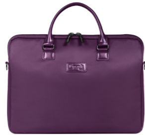
LAPTOP BAG 17" FL REF. 73910

● ● ● ● ● ● 40 X 29 X 4 CM 0.35 KG 4.5 L