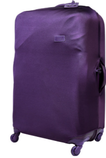
LUGGAGE COVER M REF. 3509 68397