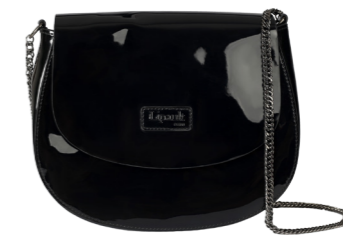
SADDLE BAG REF. 77811