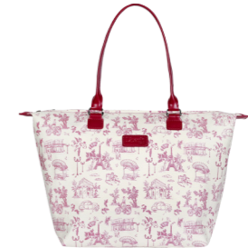
TOTE BAG M REF. 68458 30 X 32 X 16 CM 0,45 KG 17 L