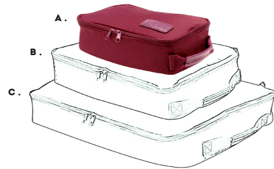
A. UNDERWEAR PACKING CASE REF. 62700