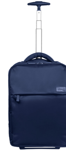
LAPTOP BACKPACK/WH FL CABIN - 2 WHEELS CABINE - 2 ROUES REF. 70711

● ● ● ● ● ● ● ● 33 X 47 X 15 CM 0.9 KG 23 L