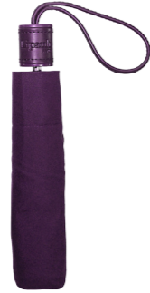
UMBRELLA 3 SECT. MANUAL REF. 3509 64794