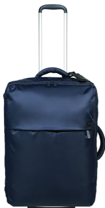
UPRIGHT 65/24 FL 2 WHEELS 2 ROUES REF. 64777