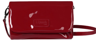
CLUTCH BAG S REF. 77812