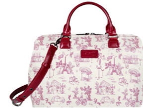
BOWLING BAG M REF. 68454 34 X 27 X 19 CM 0,63 KG 14 L

Collection Capsule Toile De Jouy ( 5581 )