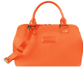
BOWLING BAG S REF. 68453

● ● ● ● ● ● ● ● NEW: ● ● ● 28 X 20 X 16 CM 0.48 KG 7.5 L