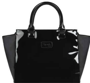
SACHEL BAG M REF. 73898