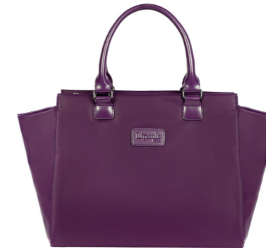
SATCHEL BAG M REF. 73915