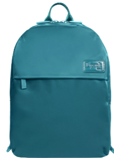
BACKPACK XS REF. 74605