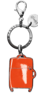
BAG CHARM - SPINNER REF. 74015