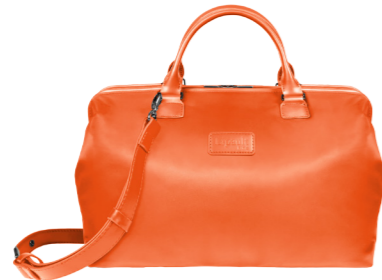
BOWLING BAG M REF. 68454

● ● ● ● ● ● ● ● NEW: ● ● ● 28 X 20 X 16 CM 0.48 KG 7.5 L