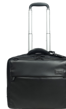
ROLLING TOTE 15" FL CABIN - 2 WHEELS CABINE - 2 ROUES REF. 70691 (JPH 1007)