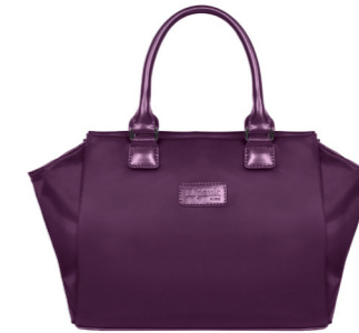
SATCHEL BAG S REF. 73914