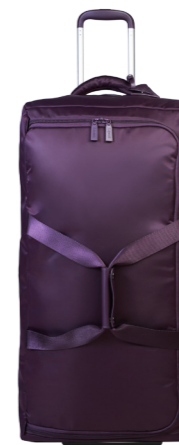
DUFFLE/WH. 78/29 FL 2 WHEELS 2 ROUES REF. 64780