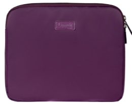
IPAD SLEEVE 11.9'' REF. 77804

● ● ● ● ● ● ● ● 26 X 21 X 2 CM 0.13 KG 1 L