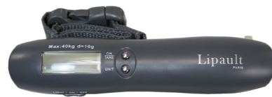
DIGITAL SCALE REF. 3509 64786 ●