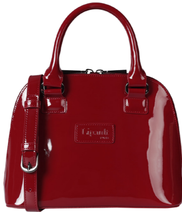
HANDLE BAG M REF. 77809