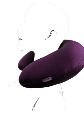
TRAVEL PILLOW REF. 3509 64787 ● ●