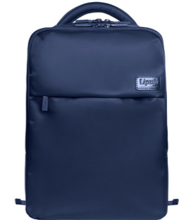
LAPTOP BACKPACK L 15" FL REF. 73954

● ● ● ● ● ● ● ● 28 X 43 X 15 CM 0.8 KG 16 L