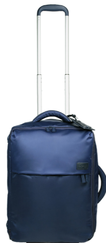
UPRIGHT 55/20 FL CABIN - 2 WHEELS CABINE - 2 ROUES REF. 64776