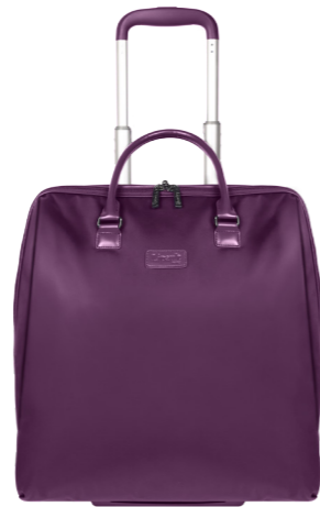
ROLLING TOTE 15" CABIN - 2 WHEELS CABINE - 2 ROUES REF. 73907

● ● ● ● ● ● 40 X 29 X 10 CM 0.55 KG 10 L