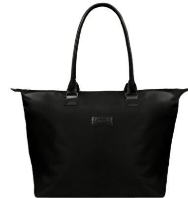
TOTE BAG M REF. 68458