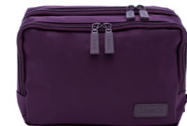
TOILET KIT 2 COMP. REF. 62607

● ● ● ● ● ● ● ● ● NEW: ● ● 30 X 22 X 13 CM