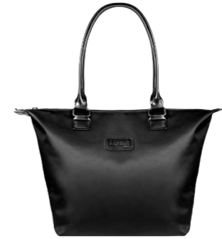
TOTE BAG S REF. 68457