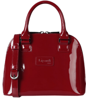
HANDLE BAG S REF. 77808