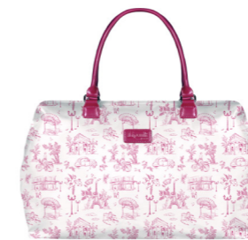
WEEKEND BAG M FL REF. 73902 47 X 26 X 24 CM 0,85 KG 33,5 L