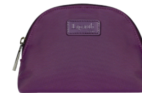
COSMETIC POUCH M

REF. 77803 ● ● ● ● ● 17 X 11 X 5.5 CM 0.05 KG 0.5 L