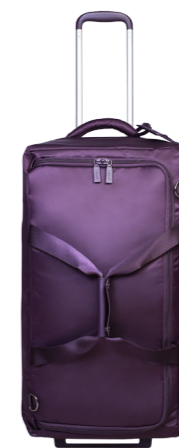
DUFFLE/WH. 68/25 FL 2 WHEELS 2 ROUES REF. 64779