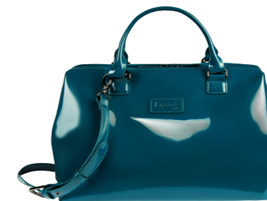
BOWLING BAG M REF. 68464