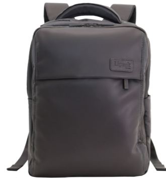
LAPTOP BACKPACK L 15" REF. 64270 (JPH 037L)