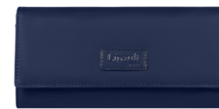
WALLET REF. 77805

REF. 77803 ● ● ● ● ● 17 X 11 X 5.5 CM 0.05 KG 0.5 L