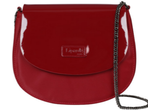
SADDLE BAG BIMAT REF. 77810