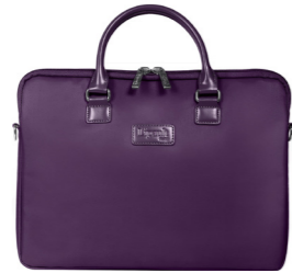
LAPTOP BAG 15" FL REF. 73909