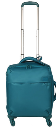
SPINNER 50/18 CABIN FOR LOW-COST AIRLINES - 4 WHEELS CABINE COMPAGNIES LOW-COST - 4 ROUES REF. 73891