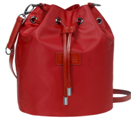
BUCKET BAG S REF. 73916