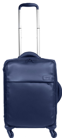
SPINNER 55/20 FL CABIN - 4 WHEELS CABINE - 4 ROUES REF. 64783 (JPH 4R 020 FL)