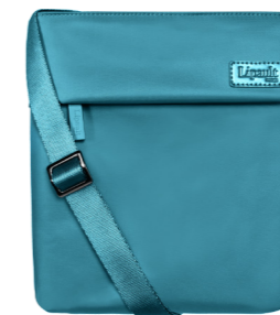
CROSS OVER BAG M REF. 74608