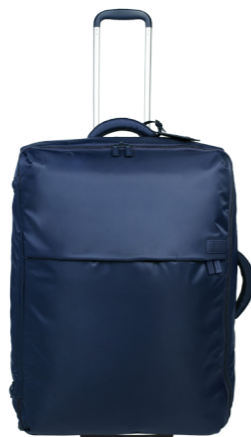
UPRIGHT 75/28 FL 2 WHEELS 2 ROUES REF. 64778