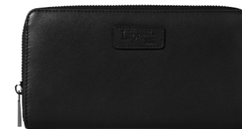
ZIP AROUND WALLET REF. 78607