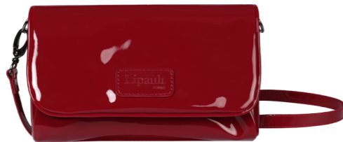
CLUTCH BAG M REF. 77813