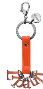
BAG CHARM - LETTERS REF. 74016